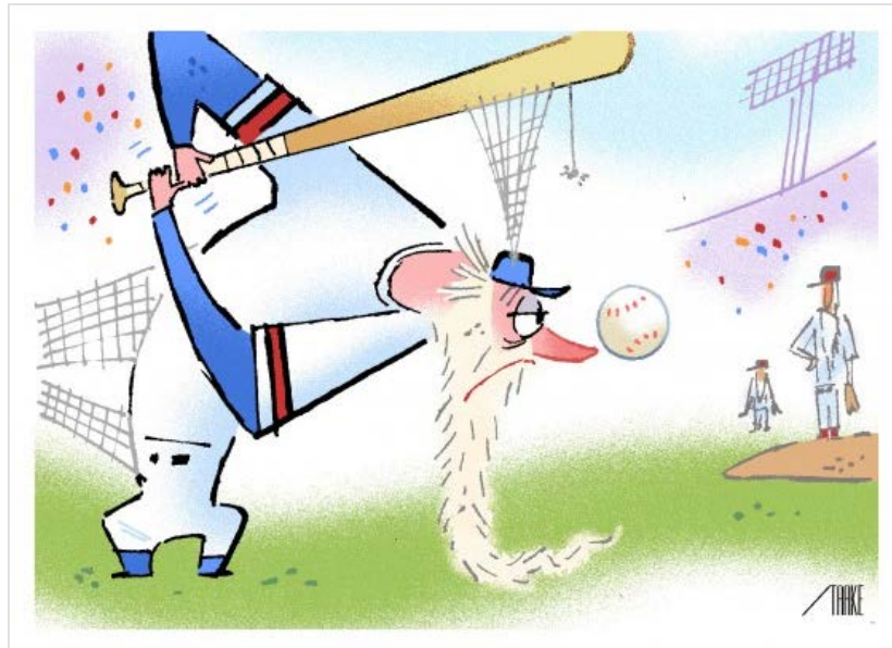
"Northwestern softball shows progress." The headline was really about the team from Northwestern High School.