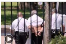
Man detained in front of White House