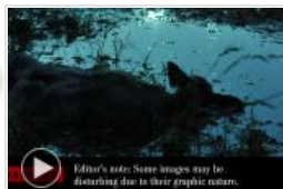
A funeral for Blue Eye