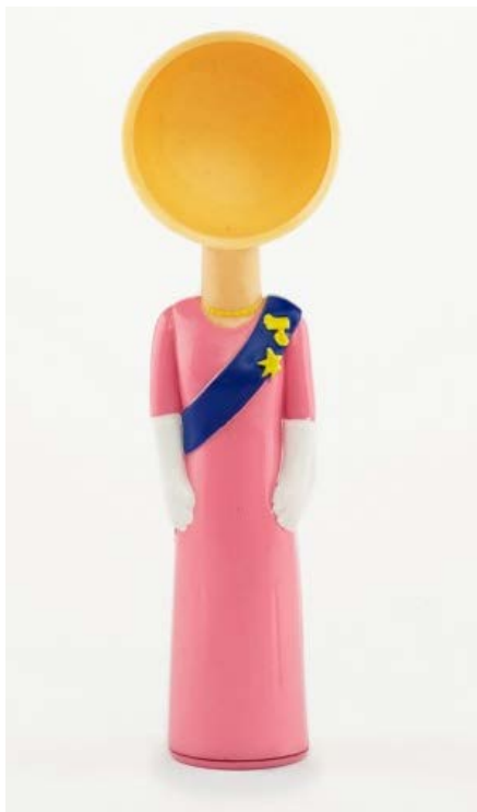
(Paladone.com) - Ice cream served up by the queen herself: Direct from England, it's this week's second prize.